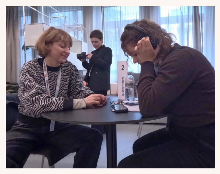
Participants to the matchmaking event

In 2024, SWAN continued its annual collaboration with SoundTrack_Zurich on two events. The first event was Matchmaking for Women in Media & Music, where female professionals working in sound get to meet female directors, producers and other film professionals for a 10-minute speed met. It took place at Publicis, on October 4, 2024.