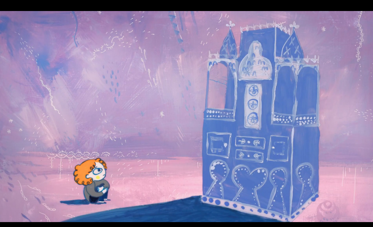
Image\ taken\ from\ "Armat",\ directed\ by\ \'Elodie\ Dermange\ \textcircled{o}\ Nadasdy\ Film\ /\ RTS\ Radio\ T\'el\'evision\ Suisse