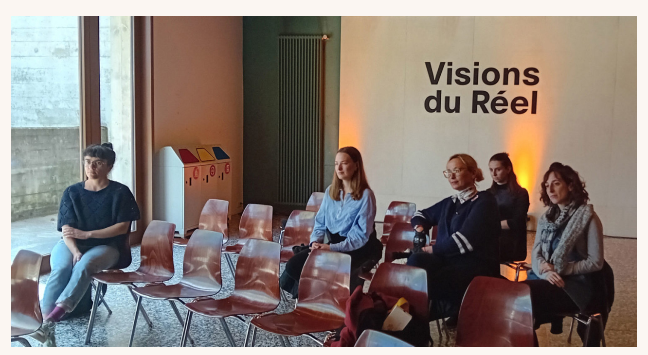
Members attending the 2024 General Assembly