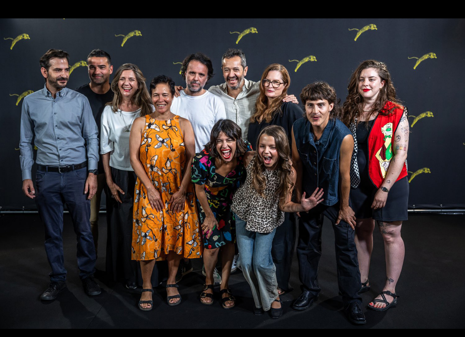
The cast and crew of "Reinas", directed by Klaudia Reinicke